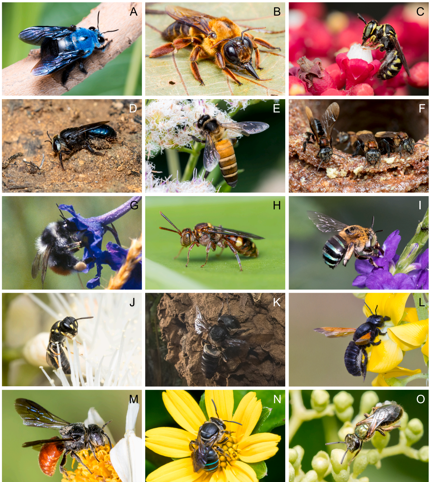
Fig. 1. Asian bee biodiversity. Apidae: A. Xylocopa insularis Smith; B. Xylocopa myops Ritsema; C. Ceratina collusor Cockerell; D. Ctenoplectra chalybea Smith; E. Apis dorsata Fabricius; F. Geniotrigona thoracica (Smith); G. Bombus supremus Morawitz; H. Nomada adusta Smith; and I. Amegilla andrewsi (Cockerell). Colletidae: J. Hylaeus penangensis (Cockerell). Megachilidae: K. Megachile pluto Smith; L. Megachile atrata Smith; and M. Euaspis polynesia Vachal. Halictidae: N. Nomia iridescens Smith and O. Lasioglossum adonidae (Cockerell).

reduction of pesticide use and pollution of water, light, and air; increase in landscape heterogeneity and semi-natural areas; implementation of pollinator-friendly practices across landscapes; protection and restoration of biodiverse areas and threatened species; and control of alien